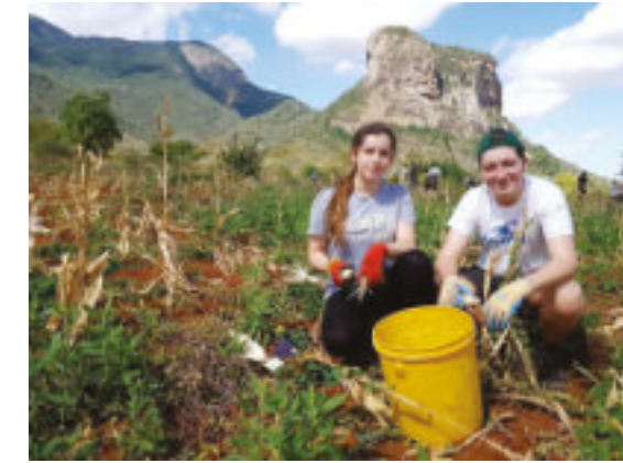
Students taking part in a Camps International visit and working to support local communities in Kenya through their own fundraising activity.