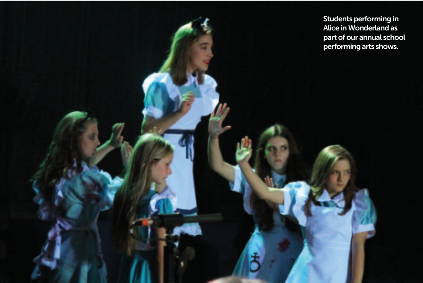
Students performing in Alice in Wonderland as part of our annual school performing arts shows.

For information on our musical and drama productions please see our school website .