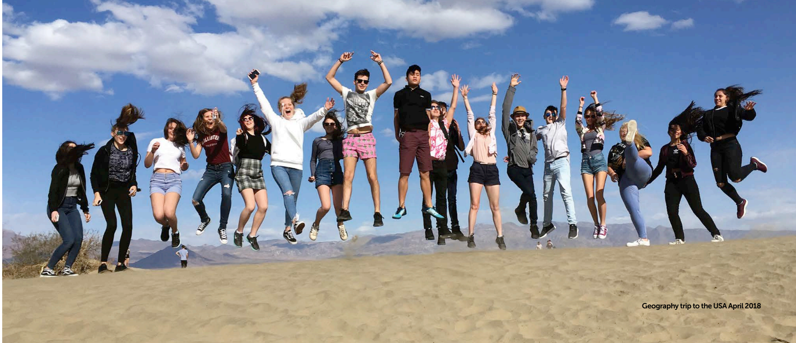
Geography trip to the USA April 2018

It will come as no surprise that the girls at Wrotham School regularly out perform students at local comprehensive, single sex girls schools in GCSE and A level studies. We proudly dispel the myth that girls don't perform as well at mixed gender schools.