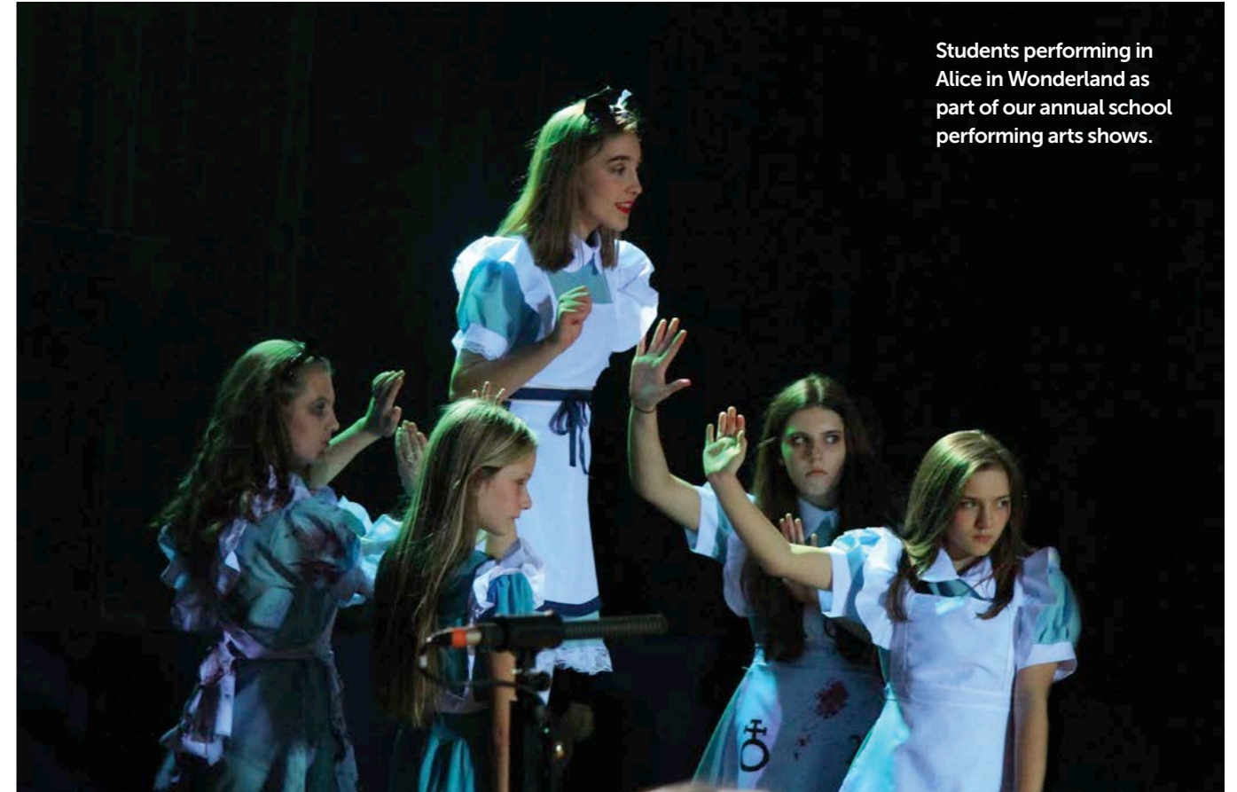
Students performing in Alice in Wonderland as part of our annual school performing arts shows.

For information on our musical and drama productions please see our school website.