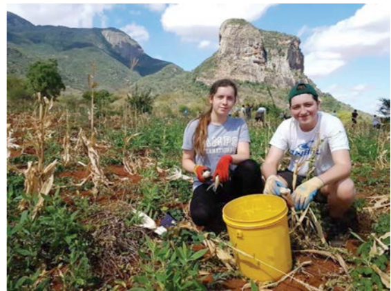
Students taking part in a Camps International visit and working to support local communities in Kenya through their own fundraising activity.